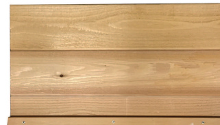
Part D • QTY 2 Ends