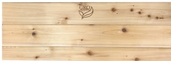
Part C • QTY 2 Sides