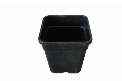
Part G • QTY 6 12" Plastic Liners